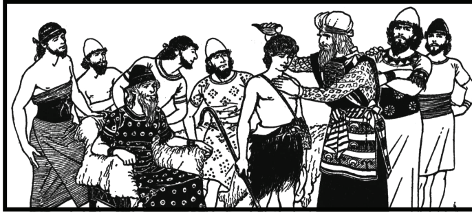
Samuel Anoints David King