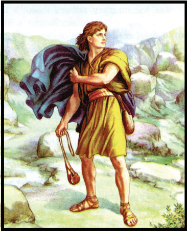
David Meets Goliath