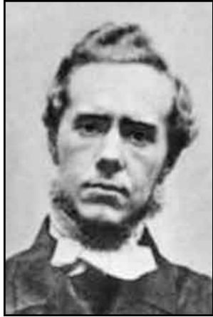
James Hudson Taylor