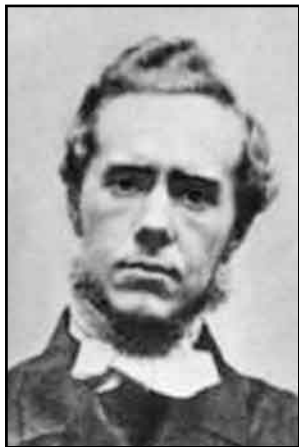
James Hudson Taylor