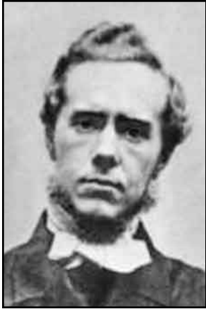
James Hudson Taylor