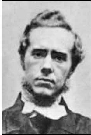
James Hudson Taylor