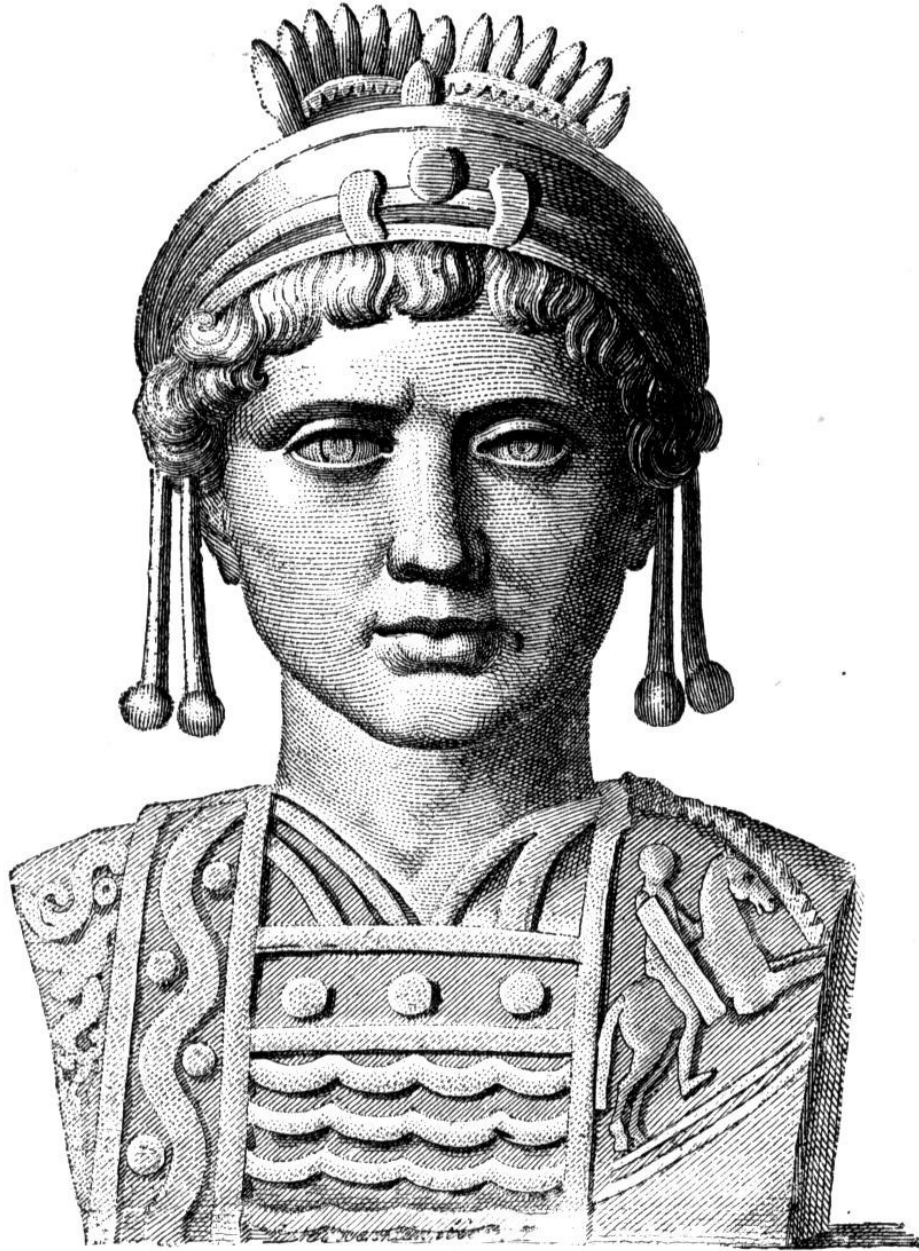
Justinian the Great